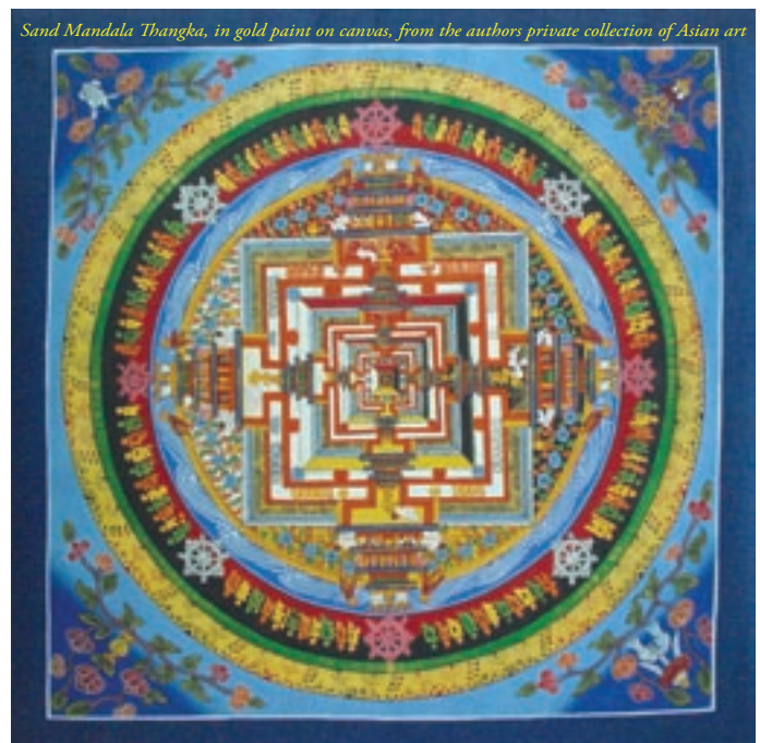
Sand Mandala Thangka, in gold paint on canvas, from the authors private collection of Asian art

The site where the sand mandala was created at Gandan Khid can still be seen just to the right of the main building, with photos of the various stages of the ceremony on display within the Monastery. ME