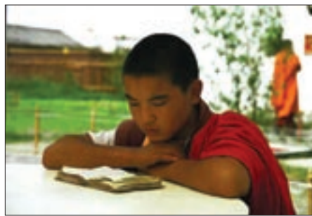
A Young Mongolian novice monk studying