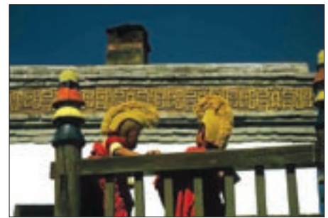
Mongolian Buddhism is primarily the Yellow Hat Sect who spiritual leader is the Dalai Lama

new monasteries opened to a greater part of the population the opportunity to become monks, resulting in a drain on Mongolian manpower. The monasteries, however, became similar to those of early medieval Europe; they were the cradles of literature and science, particularly of Buddhist philosophy. By 1629 many other lamaist works were translated into Mongolian, including the 1,161 volumes of the lamaist canon, the Bka'-gyur (Kanjur). Tibetan became the lingua franca of the clerics, as Latin was in medieval Europe, with hundreds of religious works written in this language.