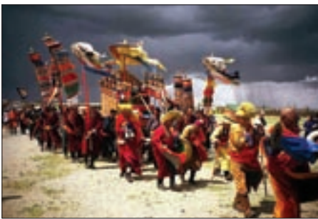
Yellow Hat Mongolian Buddhist Parade