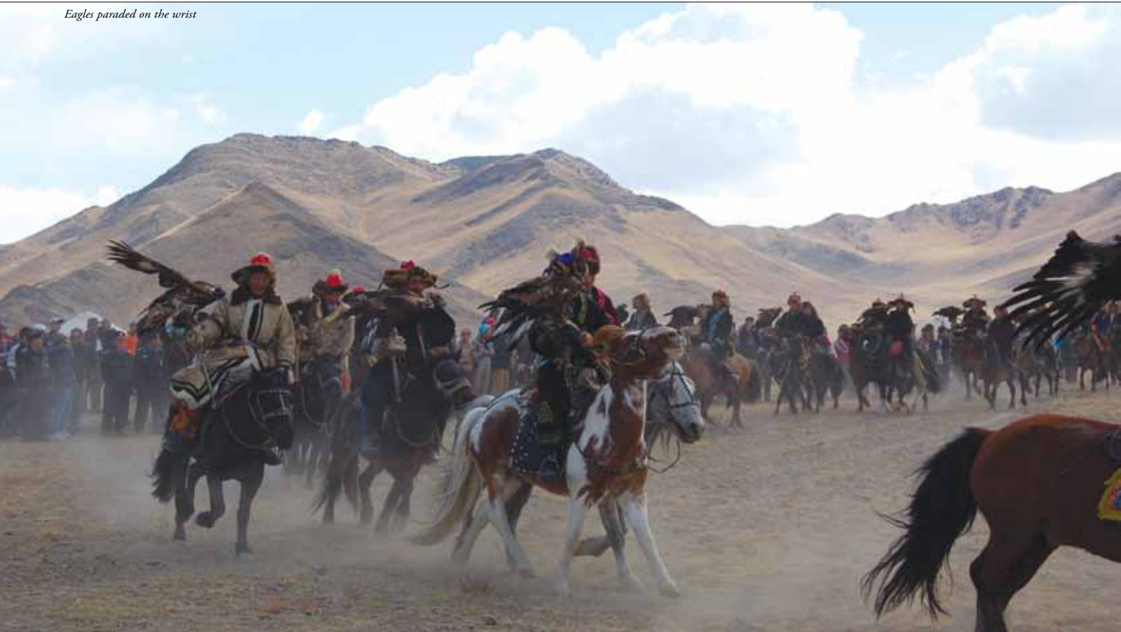
Eagles paraded on the wrist

Children are often taught respect for birds while very young and may be given smaller birds of prey, such as kestrels (which are again released after a time back into the wild) to teach them handling and management skills, and these birds too can