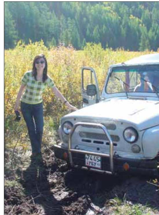
Attendance at Bog Sticking events by beautiful women is essential during this growing countryside pastime